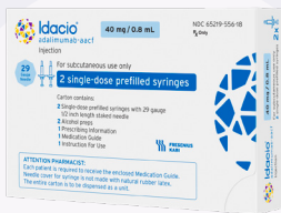
IDACIO ® Prefilled Syringe Carton 40 mg/0.8 mL (2-count)